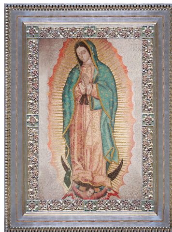
Prayer of the Nine-Month Novena to Our Lady of Guadalupe 12 March to 12 December, 2024

O Virgin Mother of God, we fly to your protection and beg your intercession against the darkness and sin which ever more envelope the world and menace the Church. Your Son, Our Lord Jesus Christ, gave you to us as our mother as He died on the Cross for our salvation. So, too, in 1531, when darkness and sin beset us, He sent you, as Our Lady of Guadalupe, on Tepeyac to lead us to Him Who alone is our light and our salvation.