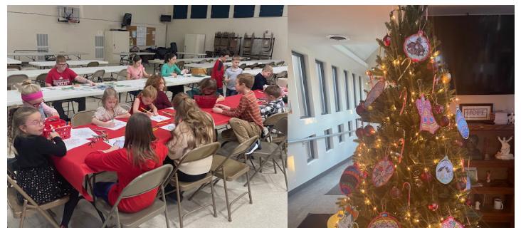
PSR students making Christmas ornaments for the parish tree!

Chyane Collins is coordinating the ticket purchase. You can reach her directly by calling / texting 740-572-2101 with your ticket quantity or questions.